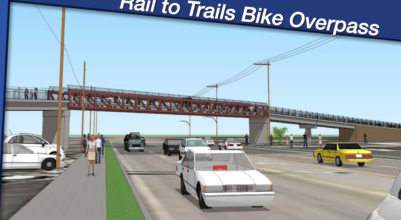
Concept art showing the overpass to be installed across Garden Street (SR 406).

Construction is progressing on the Garden Street (SR-406) overpass connecting the East Central Rail-Trail with Historic Downtown Titusville. Supports for the substructure and retaining walls are nearing completion and the first pieces of the superstructure are scheduled for delivery and installation in February 2016.