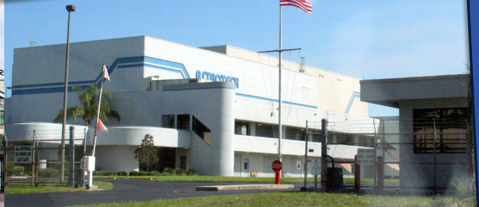
A 2011 photo showing the main entrance to the Astrotech facility in Titusville.

Lockheed Martin Corp. is in contract negotiations with the Department of Economic Opportunity (DEO), the Economic Development Commission of Florida's Space Coast, and the North Brevard Economic Development Zone to move a high tech engineering operation to the former Astrotech facility at Spaceport Commerce Park.