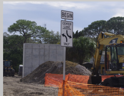
Above: Overpass construction is underway.