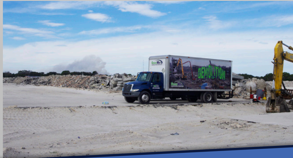
Below: Rubble is being cleared at the site of the old Miracle City Mall.

The four original structures have been demolished, with two more buildings along U.S. 1 (the former Dave's Restaurant, and the old building north of BBT Bank) scheduled for demolition in the coming months. Debris is being cleared and construction of the Parrish Medical/Mayo Clinic joint medical center and the Hobby Lobby are expected to begin before Spring. Building permits for Epic Theater and three Retail buildings are now under review. The city continues to work with the developer to approve the overall site plan.