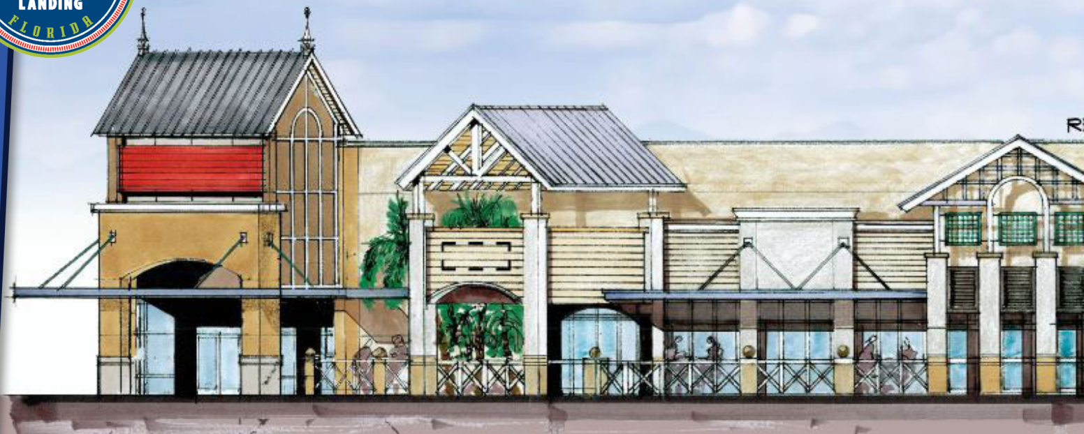
An artist's concept showing proposed restaurant and retail space in the new Titus Landing.

Late January 2016 marks the beginning of Phase 1 construction for Titus Landing, located on the site of the former Miracle City Mall. AG Development Group, Inc., and EXXCEL Project Management are investing approximately $50 million into the Redevelopment of this property in the center of Titusville.