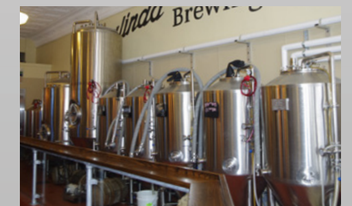
The former Lighting Industrial on U.S. 1 south of Hwy 50 is being transformed into the Brix Project Brewery.