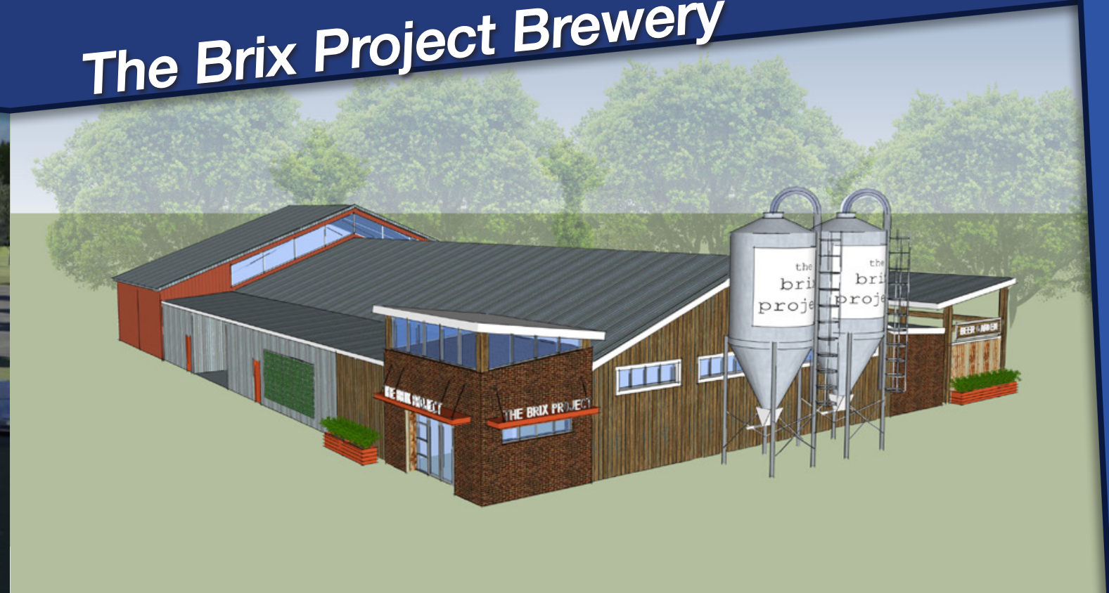
Design concept for the new Brix Project Brewery to be located south of Hwy. 50 on US1 in Titusville.

Poyalinda Brewing Company announced plans in 2015 to expand their craft brewing operations and introduce distilled spirits production in an existing 16,000 SF facility on U.S. 1 in Titusville, at the site of the former Lighting Industrial building. The expanded operations known as The Brix Project, once complete, will oversee production of upwards of 30,000 barrels annually, making it the second largest craft brewery in a 120-mile radius.