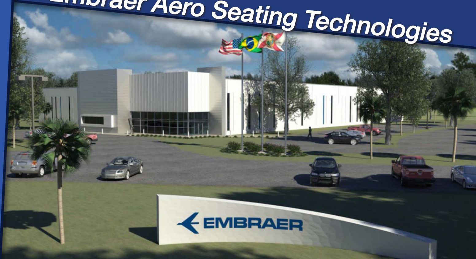
A rendering of the new Embraer Aero Seating Technologies plant to be located in Titusville.

Embraer, one of the world's largest manufacturers of commercial jets, is making a $3.5 million capital investment in Titusville with its new subsidiary Embraer Aero Seating Technologies (EAST). The new manufacturing plant will house the design and production of the seats and related equipment used in the company's line of executive jets.