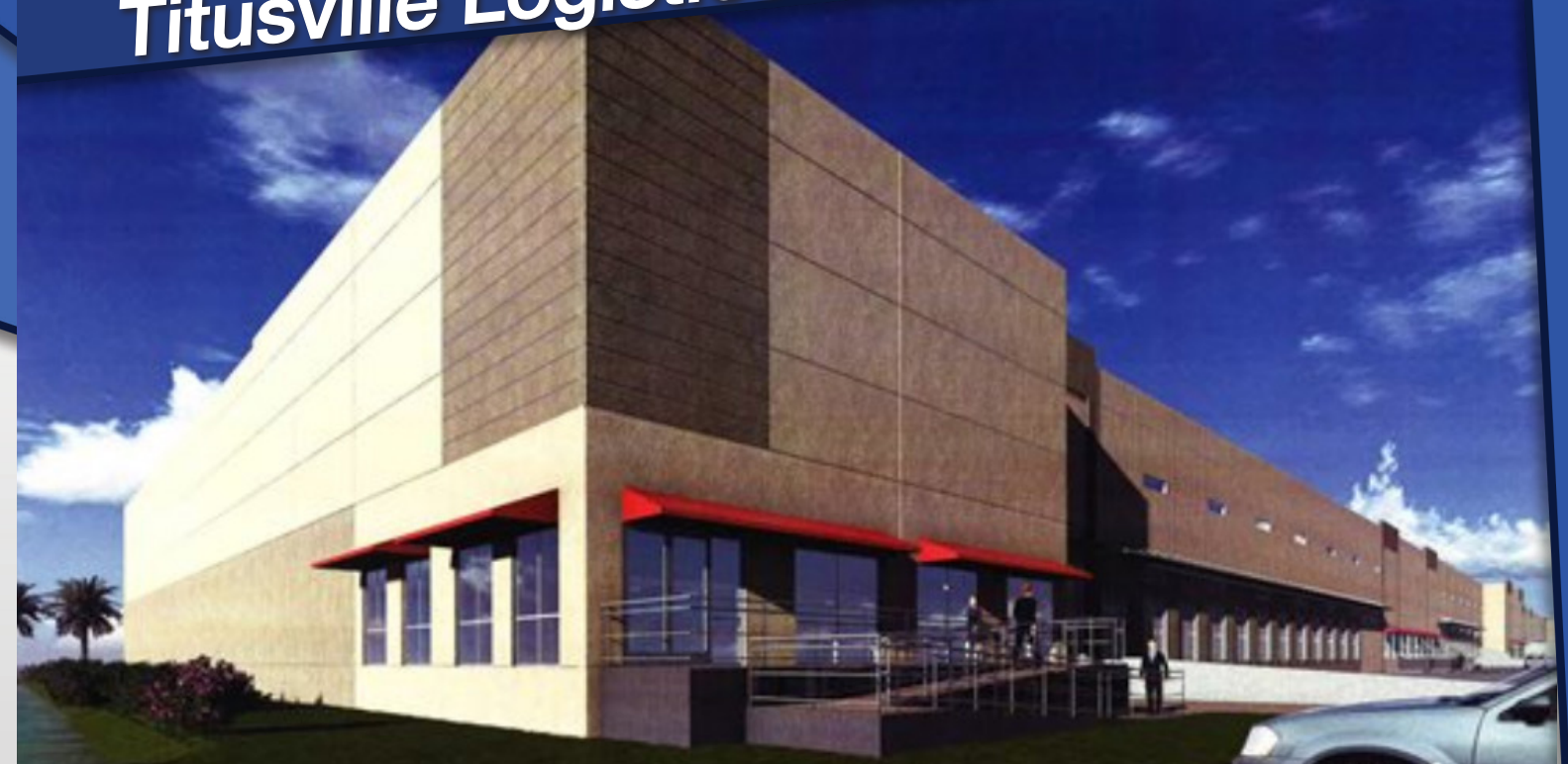
An artist's rendering showing Phase 1 of the Titusville Logistics Center, scheduled for completion in early 2016.

The 246,240-square-foot Titusville Logistics Center is rapidly taking shape and the foundation, slab, under slab and building shell have been completed. This progress moves Phase 1 of the project closer to its July 2016 completion date. Located just south of the Space Coast Regional Airport, the complex is being developed by Flagler Global Logistics, one of Florida's oldest and largest commercial real estate companies.