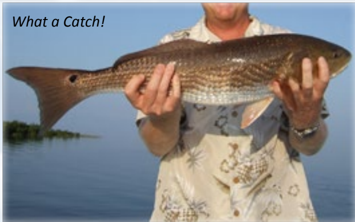
What a Catch!