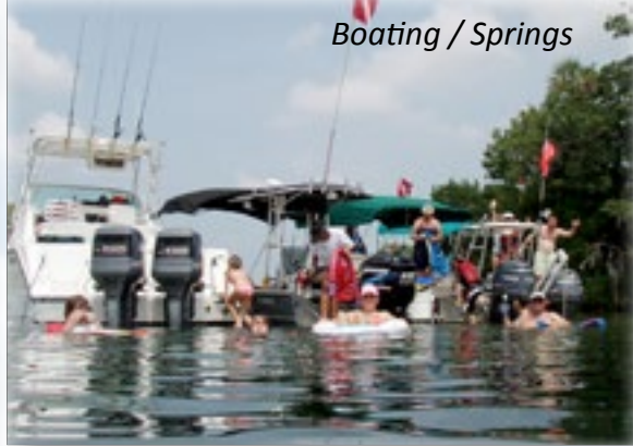
Boating / Springs