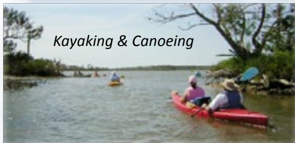
Kayaking & Canoeing