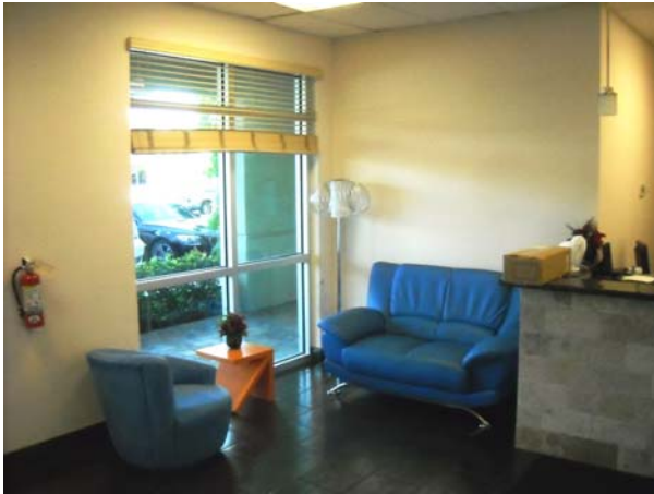
Lobby First Floor