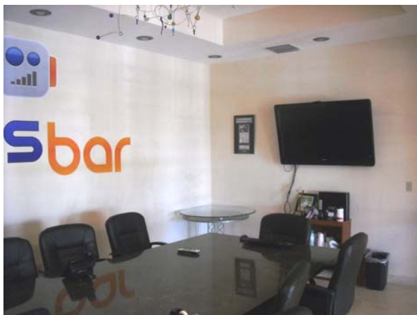
Conference Room Second Floor