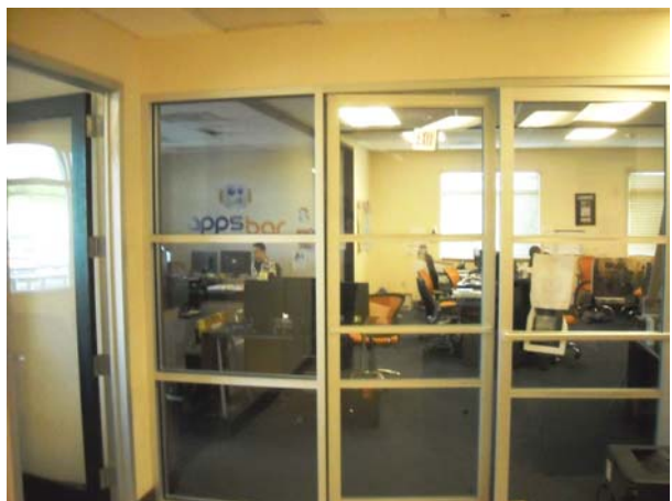
Second Floor Work Area