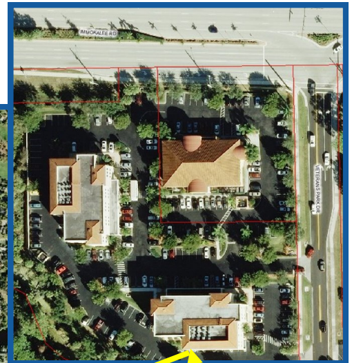
SUBJECT PROPERTY 1865 Veterans Park Dr. Naples, FL 34119

The statements and figures presented herein, while not guaranteed, are secured from sources we believe authoritative. Subject to prior sale, lease, withdrawal and price change without notice. Although the information is believed to be accurate, it is not warranted and you should not rely on it without personal verification.