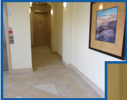
SECOND FLOOR LOBBY