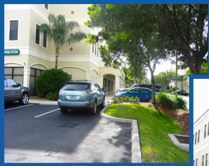
THREE STORY, CLASS "A" OFFICE BUILDING