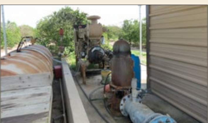
Excellent Ag Investment! Good Producing Citrus Grove Turnkey Production - Infrastructure in Place!