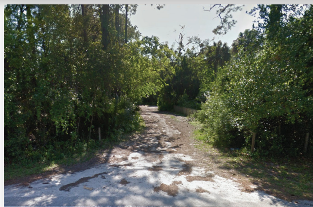
Dirt road access off Turnbull Bay Rd.

Great area of residential homes. Near parks, golf courses, New Smyrna Beach Municipal Airport and lots of recreational land and water.