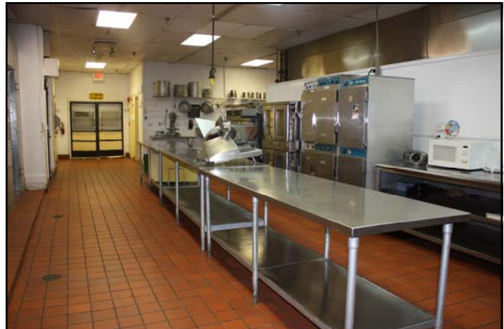
Kitchen - One can be used as a Kosher Kitchen

Brenner Real Estate Group: Fort Lauderdale 1500 West Cypress Creek Road, Suite 409 | Fort Lauderdale, FL 33309 Phone: 954.596.5555 | Fax: 954.596.5556