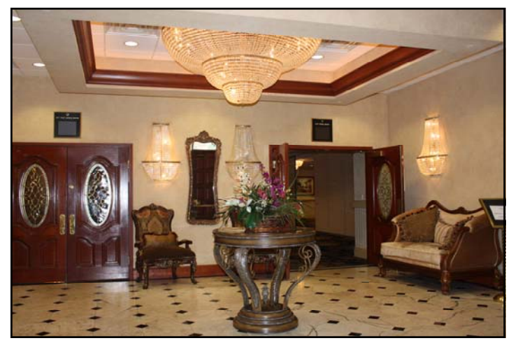
Front Entrance / Main Lobby