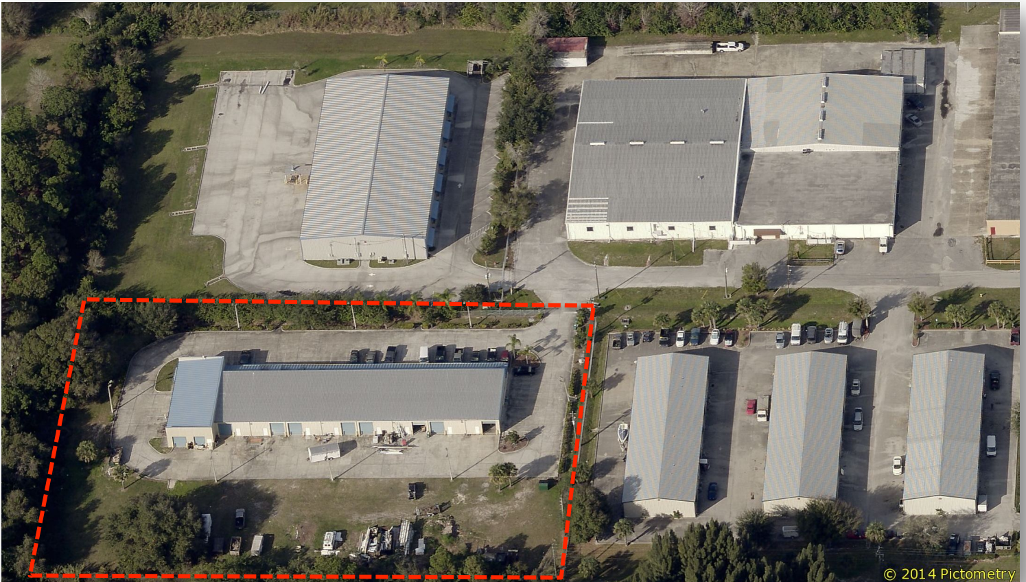
Aerial of property facing north - 2.41 Acres