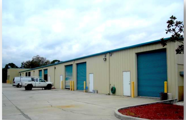
Units have OHDs with side door entry