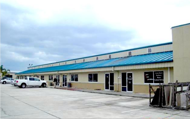
Units have glass door entry and small office areas