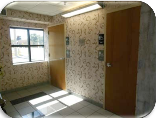
Common area restrooms