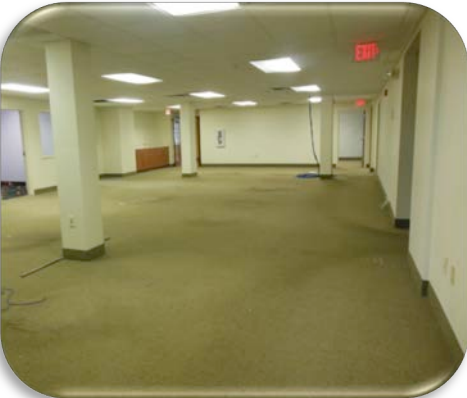
Open work area