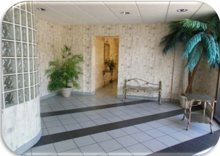
Common Lobby Area