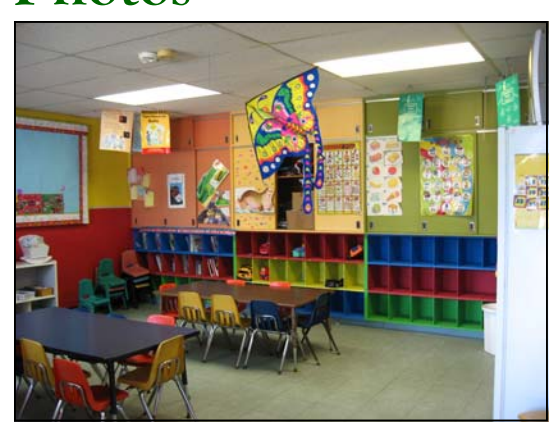
Day Care Room