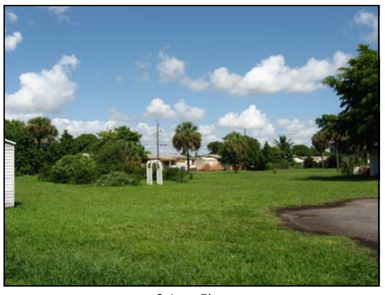
3 Acre Site

Brenner Real Estate Group: Fort Lauderdale 1500 West Cypress Creek Road, Suite 409 | Fort Lauderdale, FL 33309 Phone: 954.596.5555 | Fax: 954.596.5556