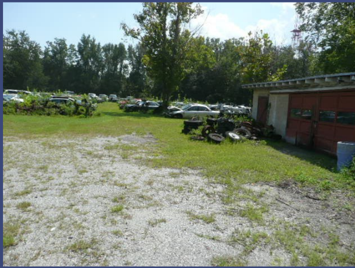
Storage yard with Shed