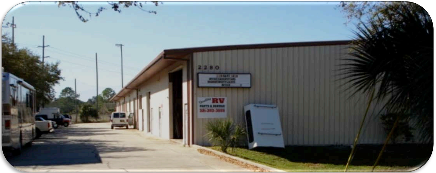
Located south of Lake Washington Rd. near US 1