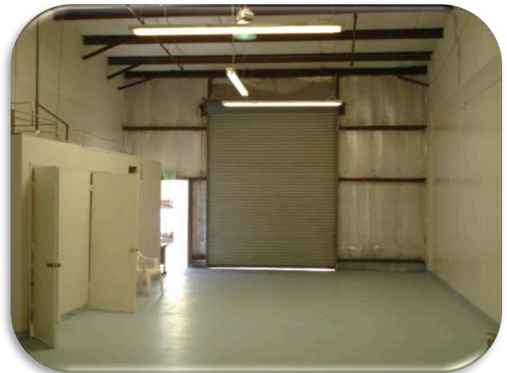
Typical interior with roll-up door, office and a restroom