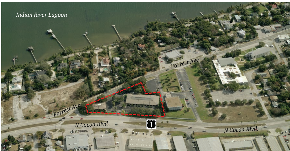
Aerial Bird's Eye View – facing east