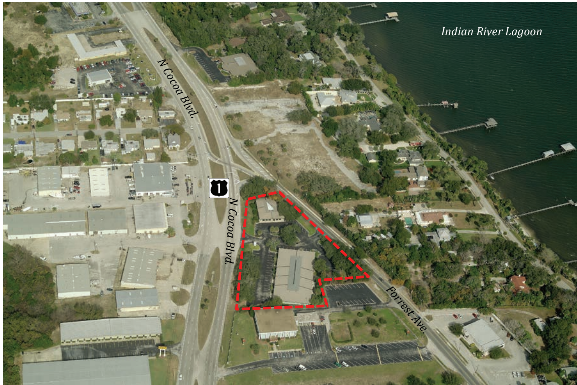
Aerial Bird's Eye View – facing north

840 N. Cocoa Blvd. (Hwy. US 1) Cocoa, FL 32922