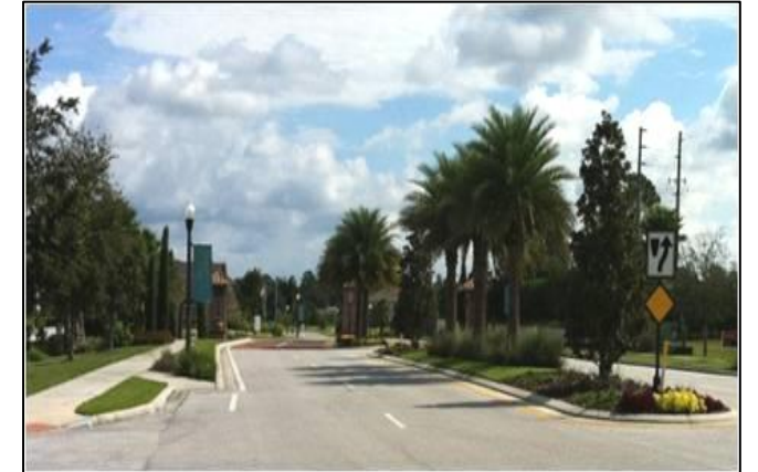
Entrance to single family