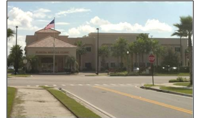
Florida Medical Center