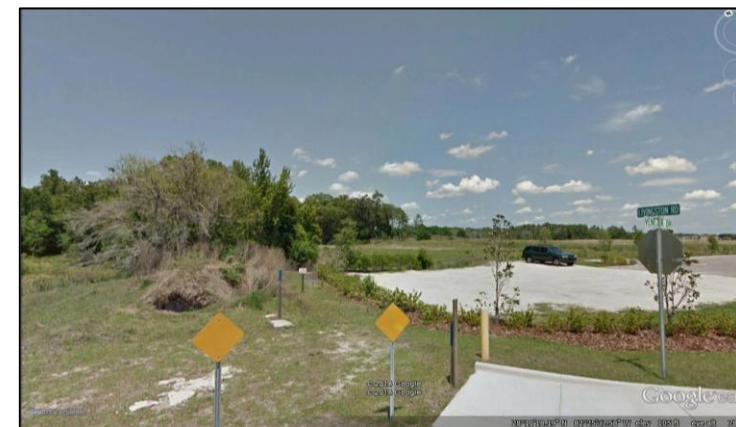
Ground Shot looking north