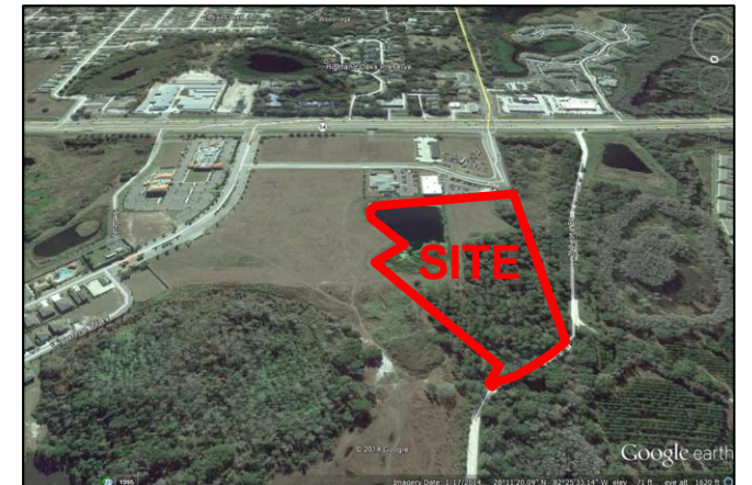
Site looking south