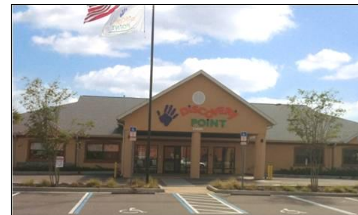
Discovery Point Day Care