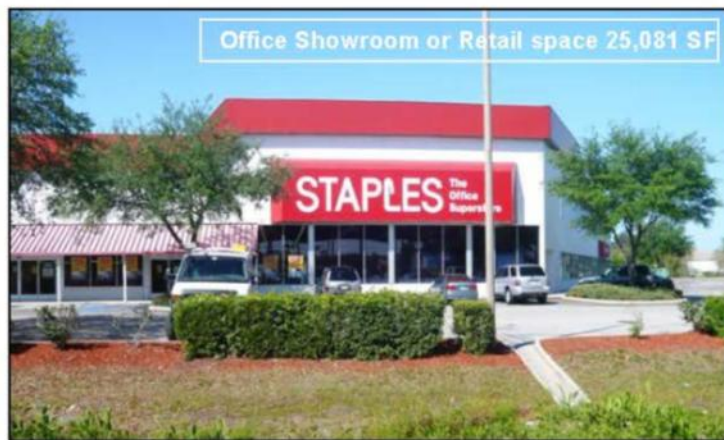
Office Showroom or Retail space 25,081 SF