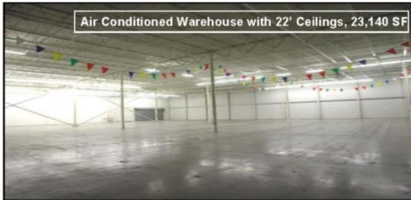
Air Conditioned Warehouse with 22' Ceilings, 23,140 SF