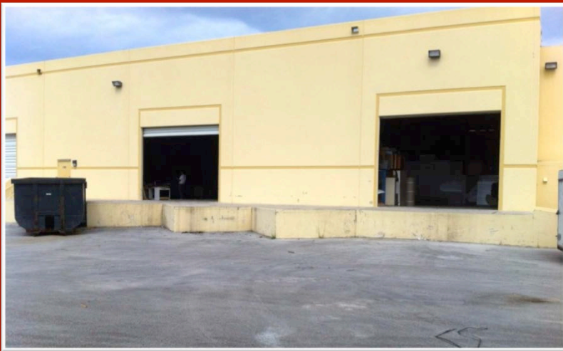
Dock Height Loading