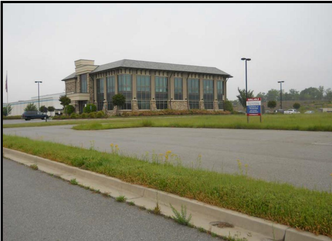
VIEW OF SUBJECT