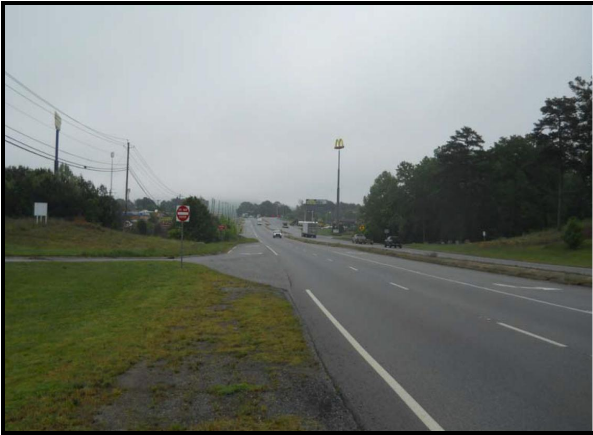
VIEW LOOKING EAST ALONG HWY 140