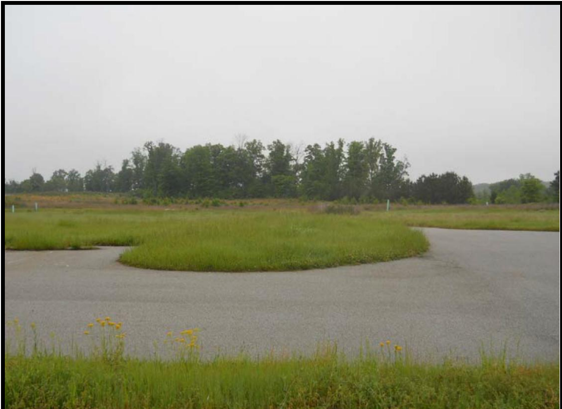
VIEW OF SUBJECT