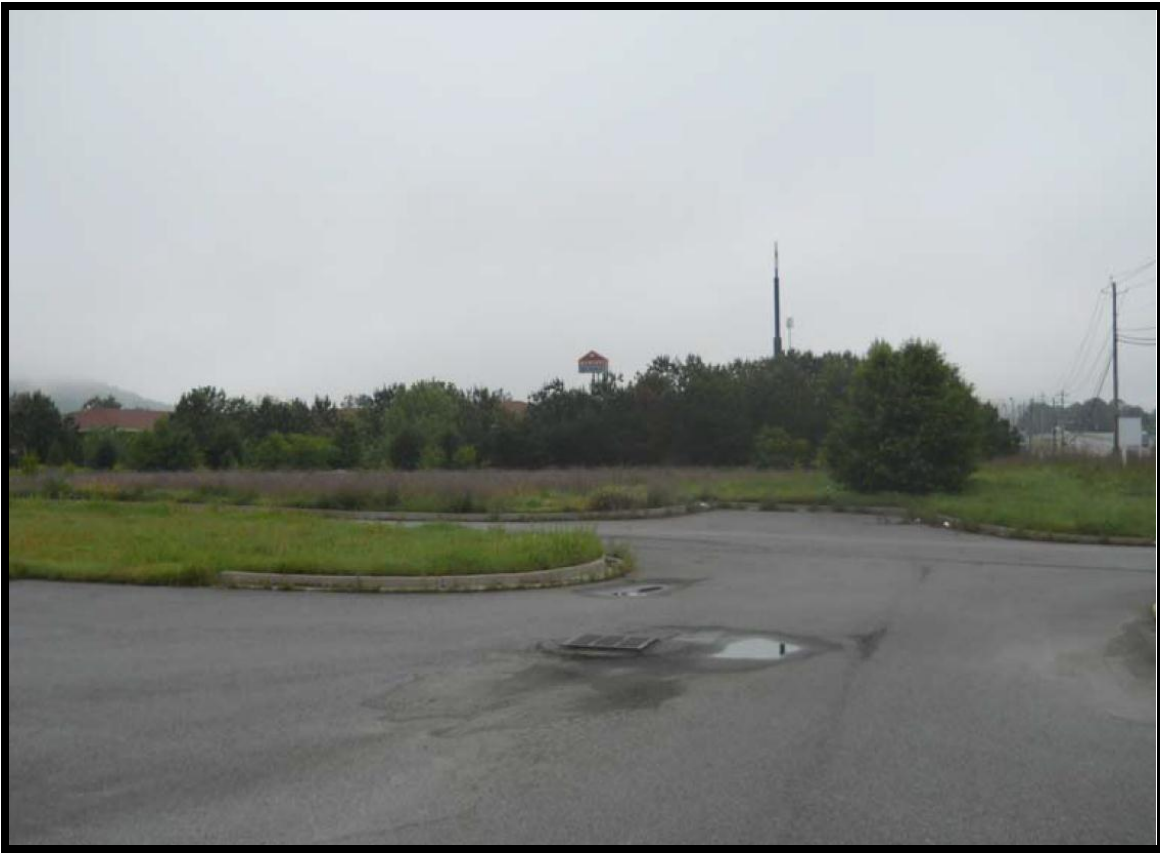
VIEW OF SUBJECT