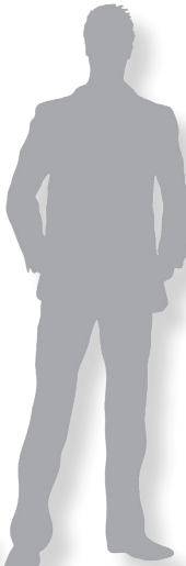
6 FT FIGURE