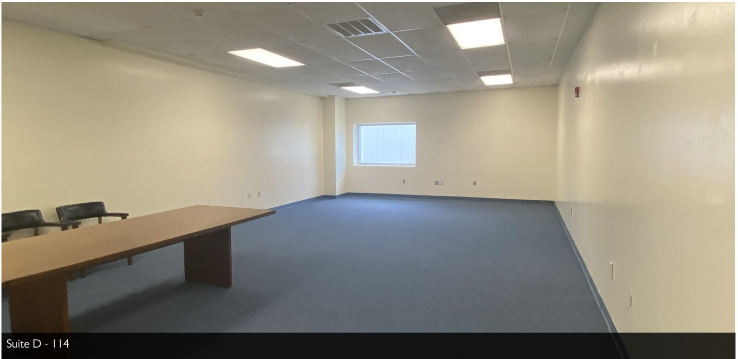
Suite D - 114