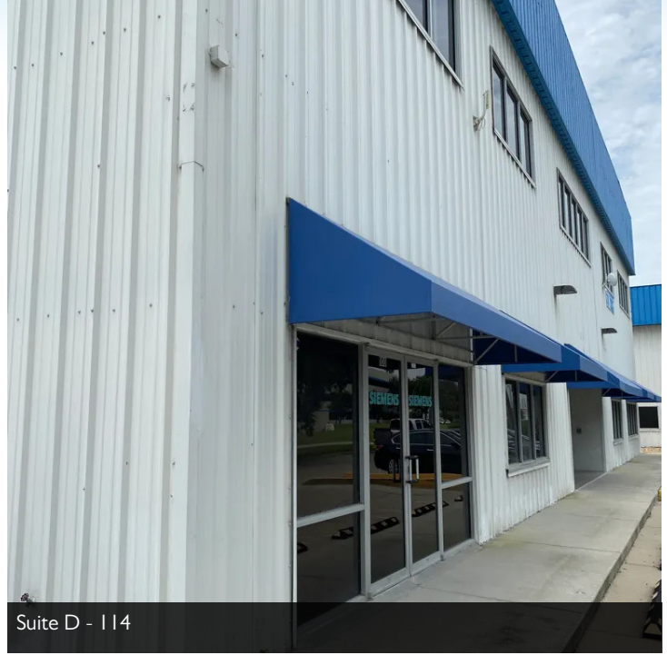
Suite D - 114