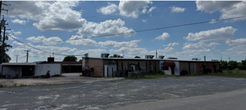
Office from houser mill