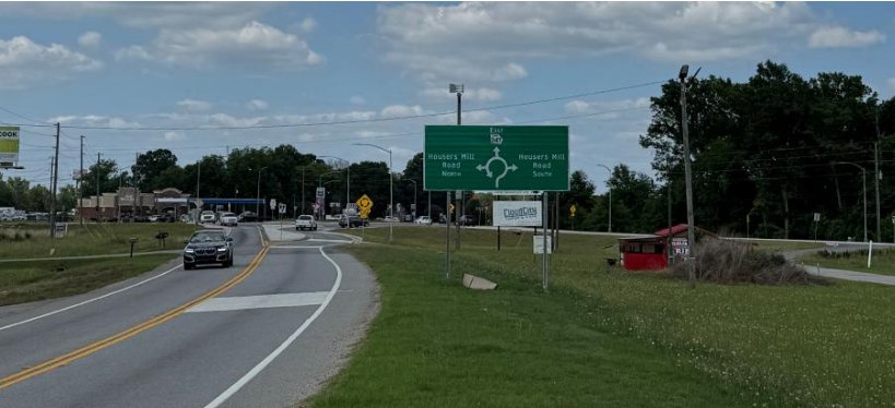
Roundabout at Housers Mill