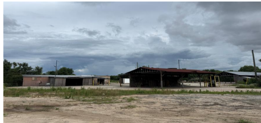
Office and Warehouse of Pole Barn