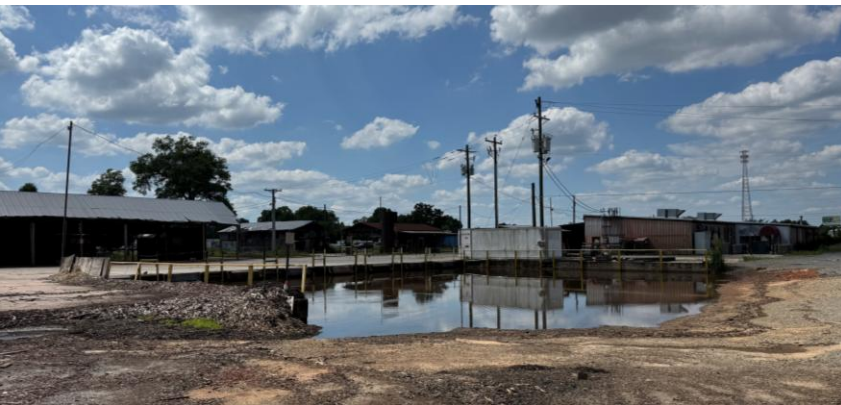
Eight inground docks with dock levelers