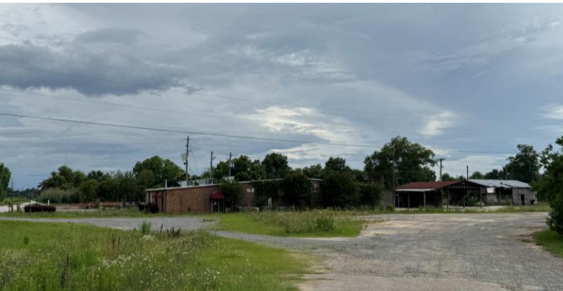
View from Roundabout