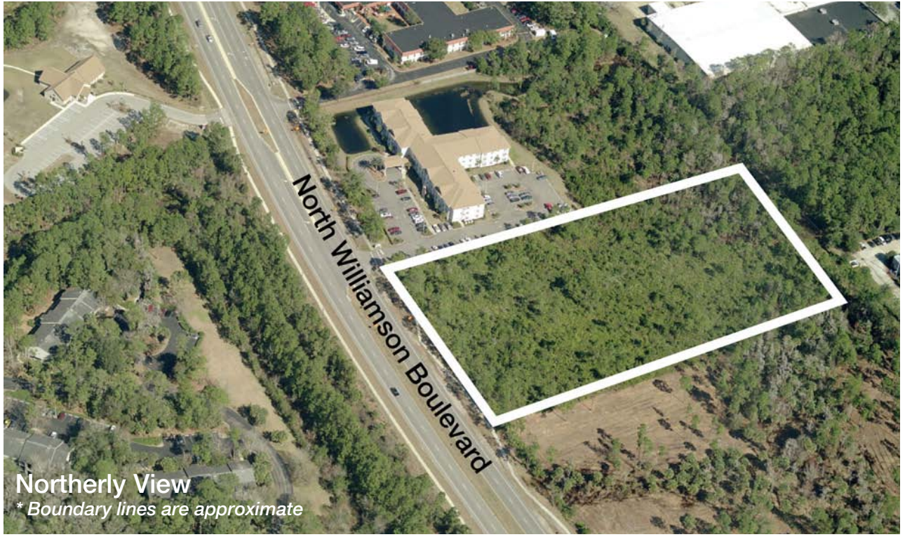
Northerly View * Boundary lines are approximate