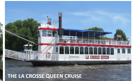
THE LA CROSSE QUEEN CRUISE