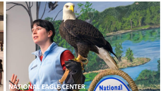
NATIONAL EAGLE CENTER