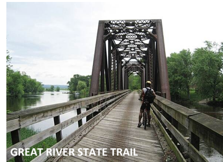
GREAT RIVER STATE TRAIL

The Onalaska Omni Center is a versatile community venue that hosts everything from sporting events to public festivals and private gatherings. With modern facilities and plenty of space, it serves as a central location for entertainment, social events, and cultural celebrations throughout the year.