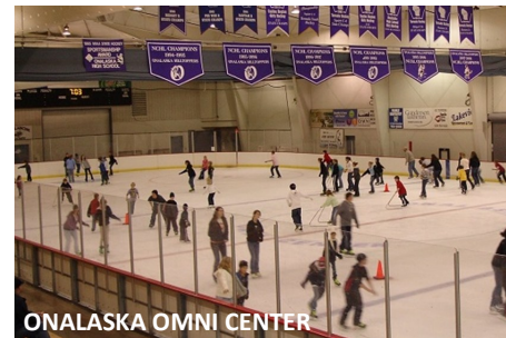
ONALASKA OMNI CENTER