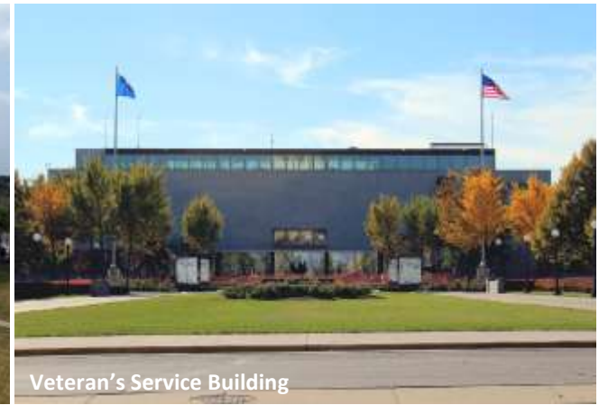
Veteran's Service Building

THIS INFORMATION HAS BEEN SECURED FROM SOURCES WE BELIEVE TO BE RELIABLE, BUT WE MAKE NO REPRESENTATIONS OR WARRANTIES, EXPRESSED OR IMPLIED, AS TO THE ACCURACY OF THE INFORMATION. REFERENCES TO SQUARE FOOTAGE OR AGE ARE APPROXIMATE. UPLAND HAS NOT REVIEWED OR VERIFIED THIS INFORMATION. BUYER MUST VERIFY THE INFORMATION AND BEARS ALL RISK FOR ANY INACCURACIES.