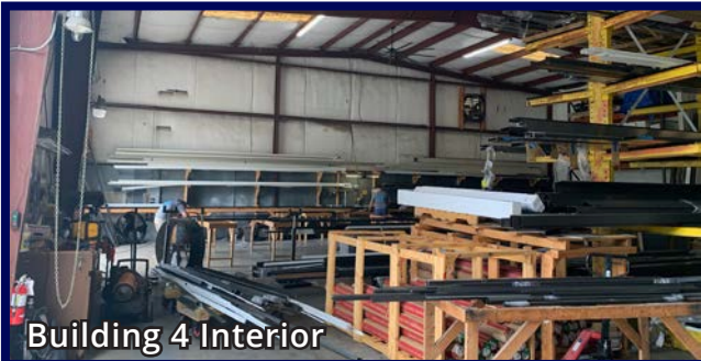
Building 4 Interior