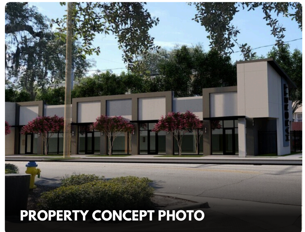
PROPERTY CONCEPT PHOTO