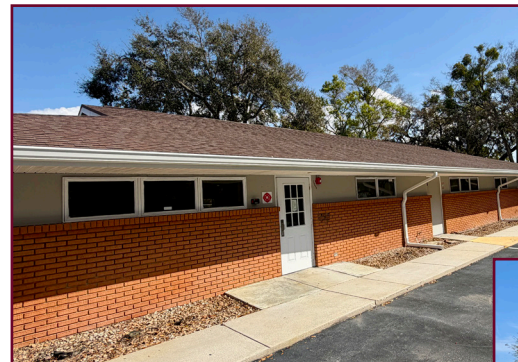
Building Exterior - Nice brick facade