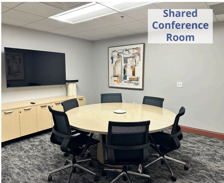
Shared Conference Room