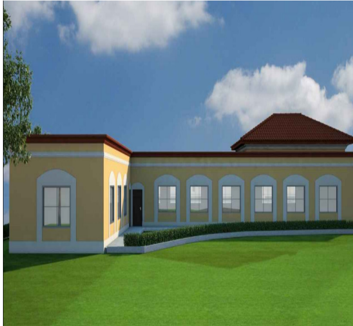
North Elevation Rendering