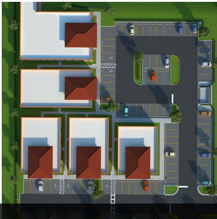
Renderings of Buildings