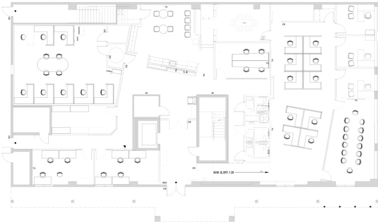
FLOOR PLAN (FIRST FLOOR) 1/8" = 1'-0" 0 8 16 24 LBR