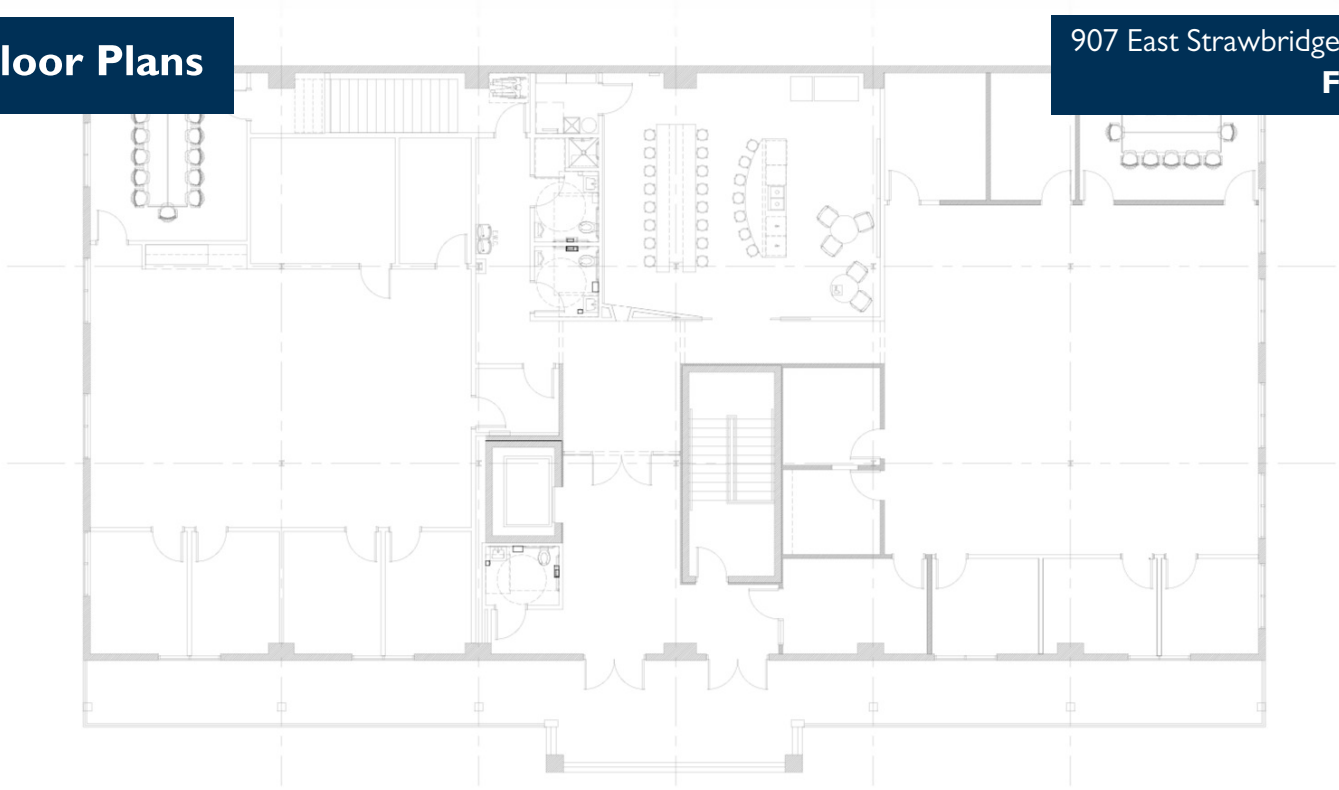
FLOOR PLAN (SECOND FLOOR) 1/8" = 1'-0" 0 8 16 24