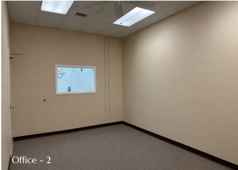
Office - 2