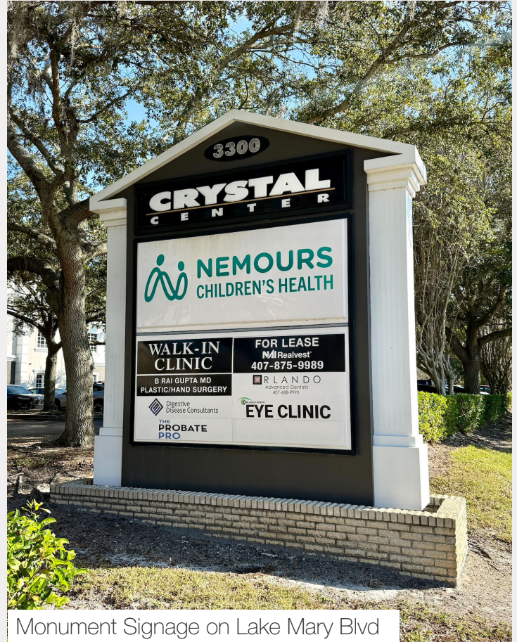
Monument Signage on Lake Mary Blvd