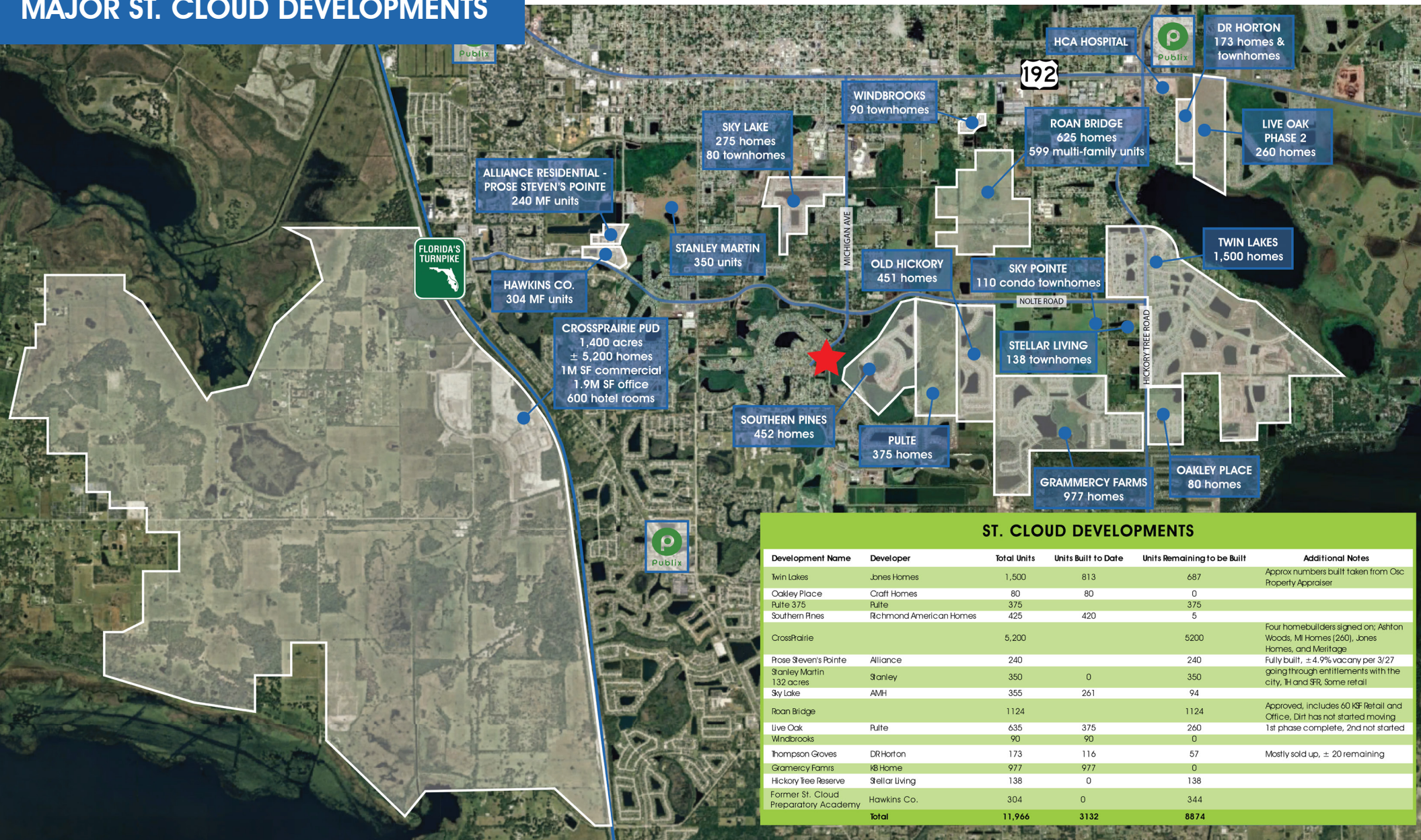
ST. CLOUD DEVELOPMENTS