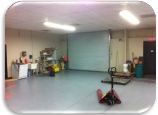
Interior Warehouse OHD