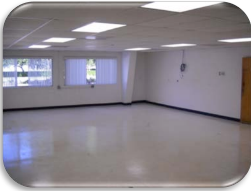
Interior Office area