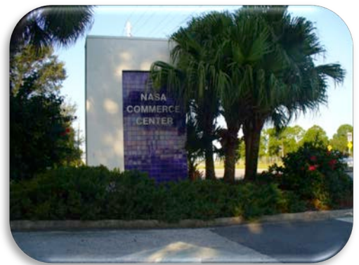
NASA Commerce Center signage