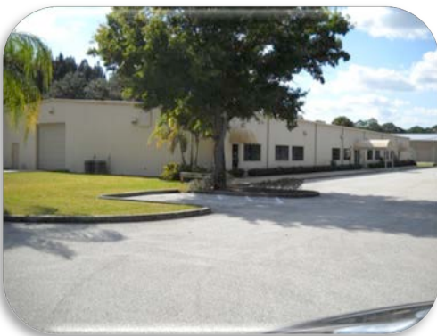
Single OHD & Front exterior