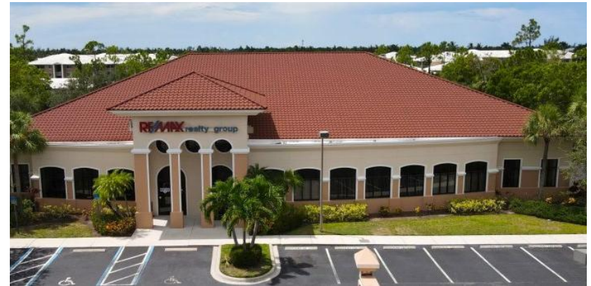
REMAX Realty Group 7910 Summerlin Lakes Dr., Fort Myers, FL 33907 O: (239) 489-0444 | ftmyerscommercial.com