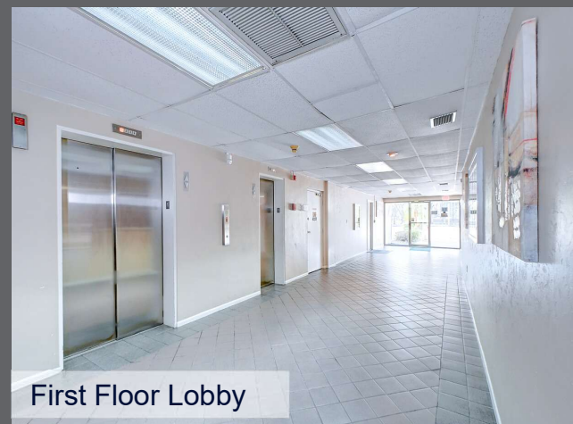
First Floor Lobby