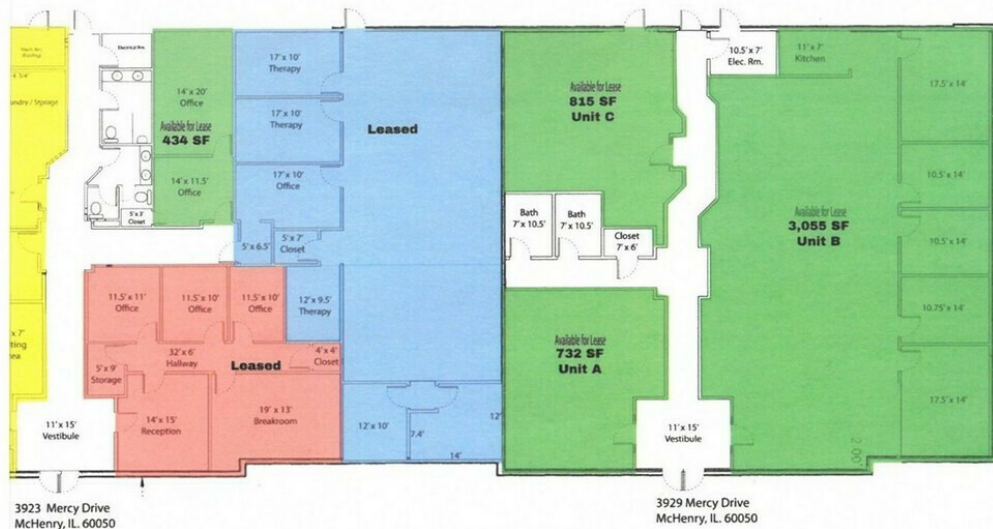
SUITE A: 732 SF SUITE B: 3,055 SF (w/ office buildout) SUITE C: 815 SF SUITE E: 434 SF