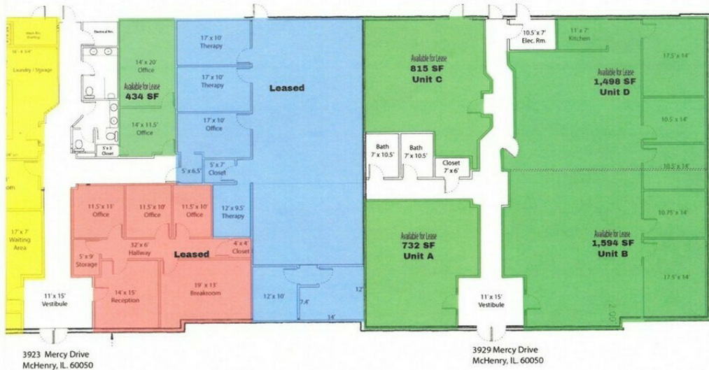
SUITE A: 732 SF SUITE B: 1,594 SF (w/ office buildout) SUITE C: 815 SF SUITE D: 1,498 SF (w/ office buildout) SUITE E: 434 SF