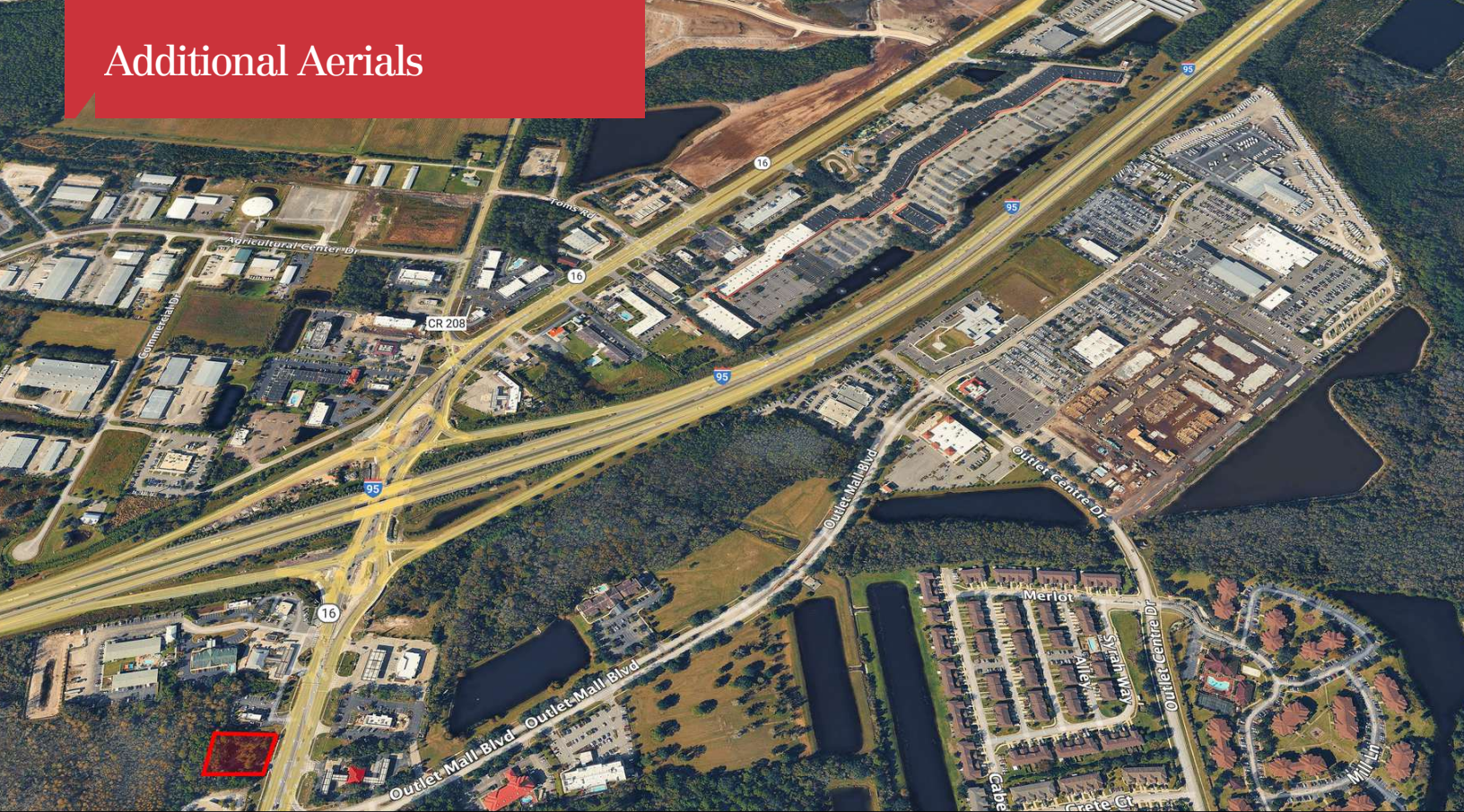
Aerial Facing East