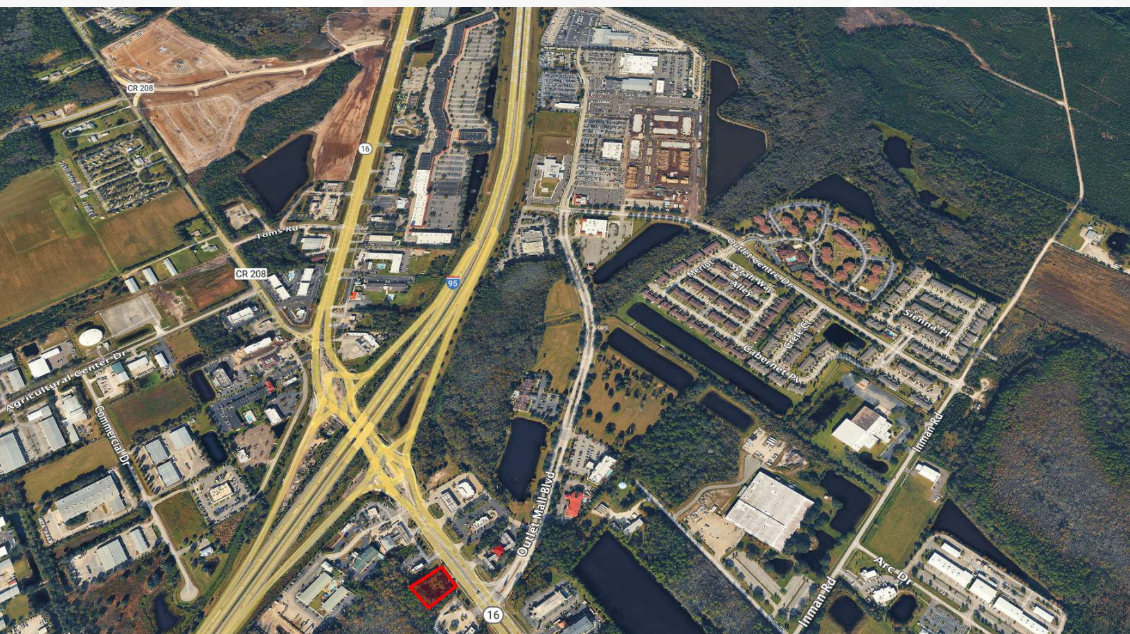
Aerial Facing North West