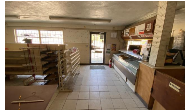
Interior Convenience Store