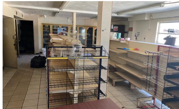
Interior Convenience Store