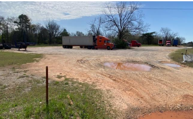
Tractor Trailer Parking