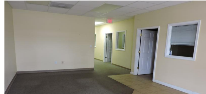
Back Office Spaces 2,400± SF – Reception