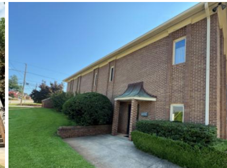
1st Floor Entrance