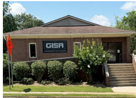
2 nd Floor Entrance

This 5,412 SF two-story office building is situated on a 0.26 Acre corner lot. The first floor is 2,530 SF and is comprised of 5 offices, 2 restrooms, lobby, conference room, break room, file room, storage room, and work room. The second floor is 1,332 SF and is comprised of 5 offices, 1½ restrooms, reception, lobby, storage, and a nurse room. Property was renovated in 2001, roof was replaced in 2010. Ideal for medical or professional office. Individual floors utilities are separately metered.