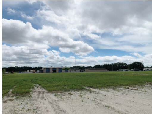
Outside Storage Area