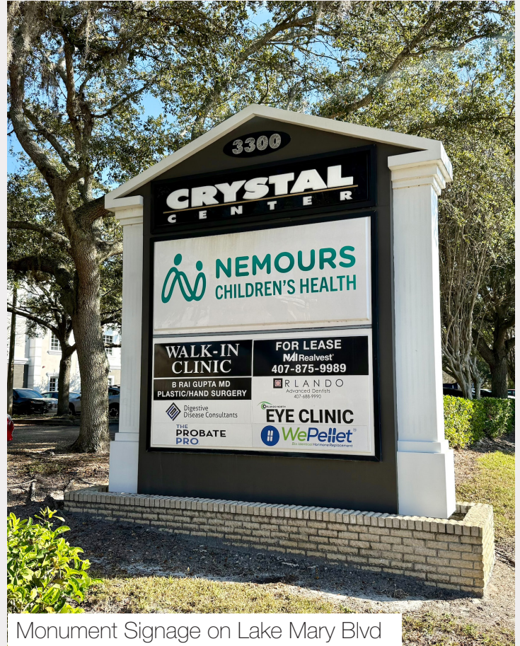
Monument Signage on Lake Mary Blvd