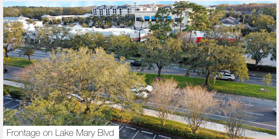
Frontage on Lake Mary Blvd