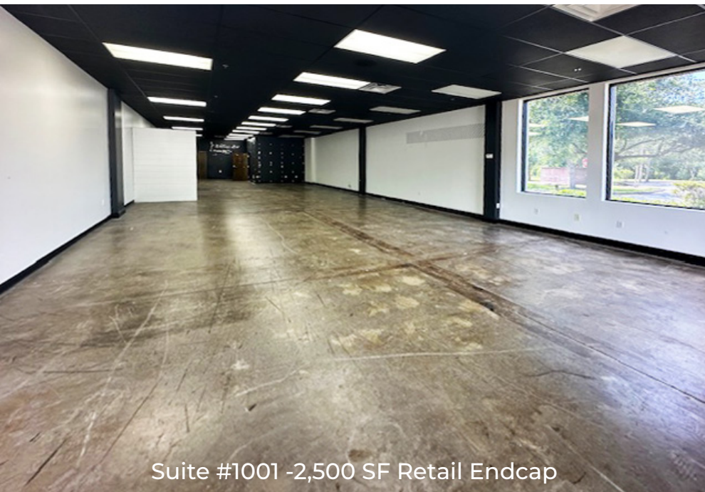
Suite #1001 -2,500 SF Retail Endcap