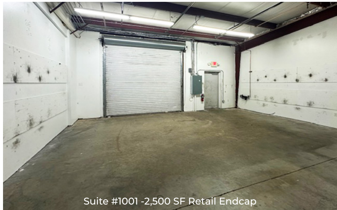
Suite #1001 -2,500 SF Retail Endcap