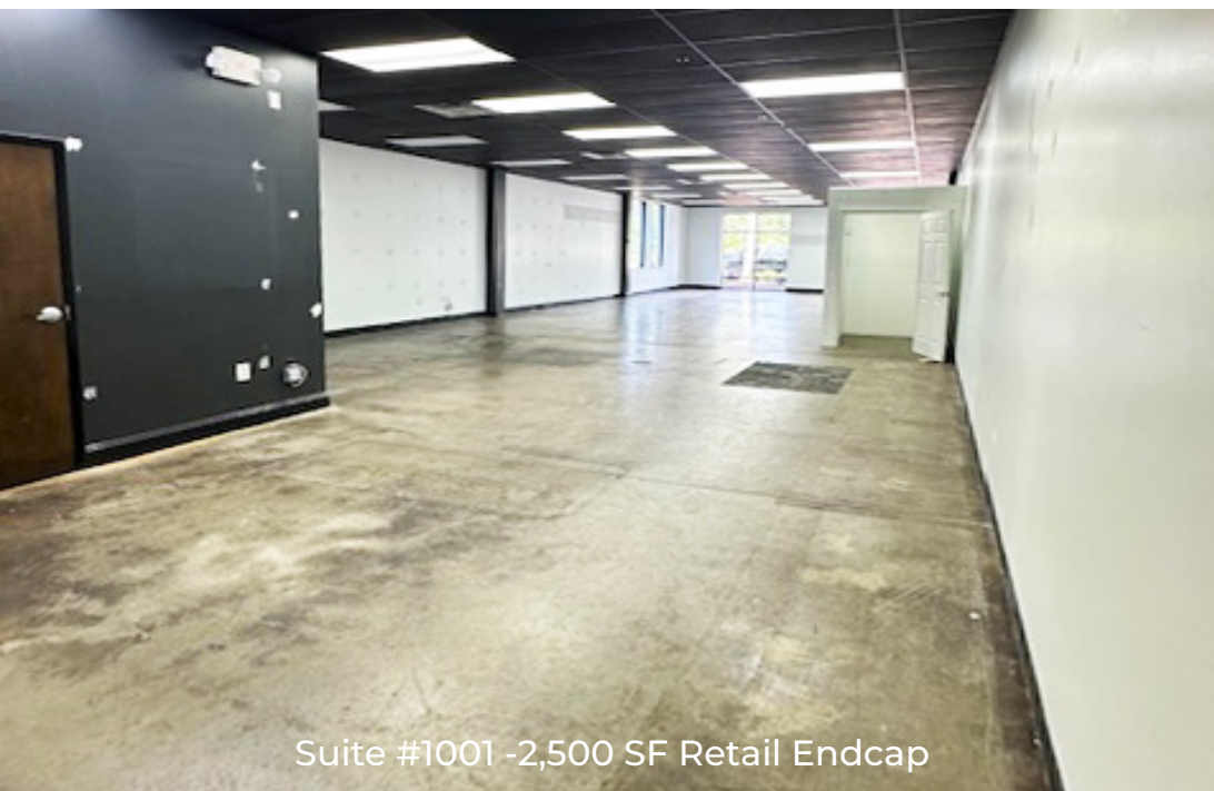
Suite #1001 -2,500 SF Retail Endcap