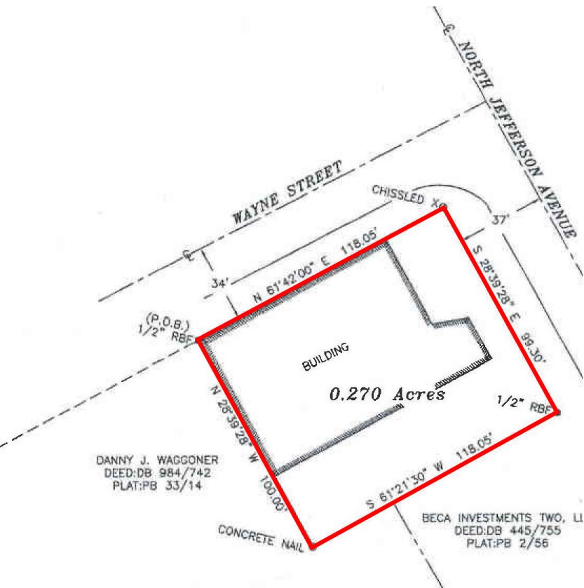
PROPERTY SITE MAP