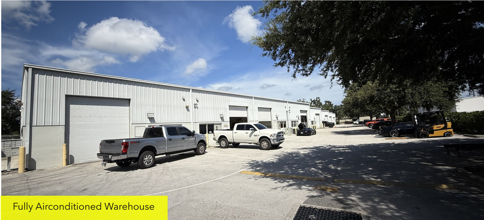
Fully Airconditioned Warehouse