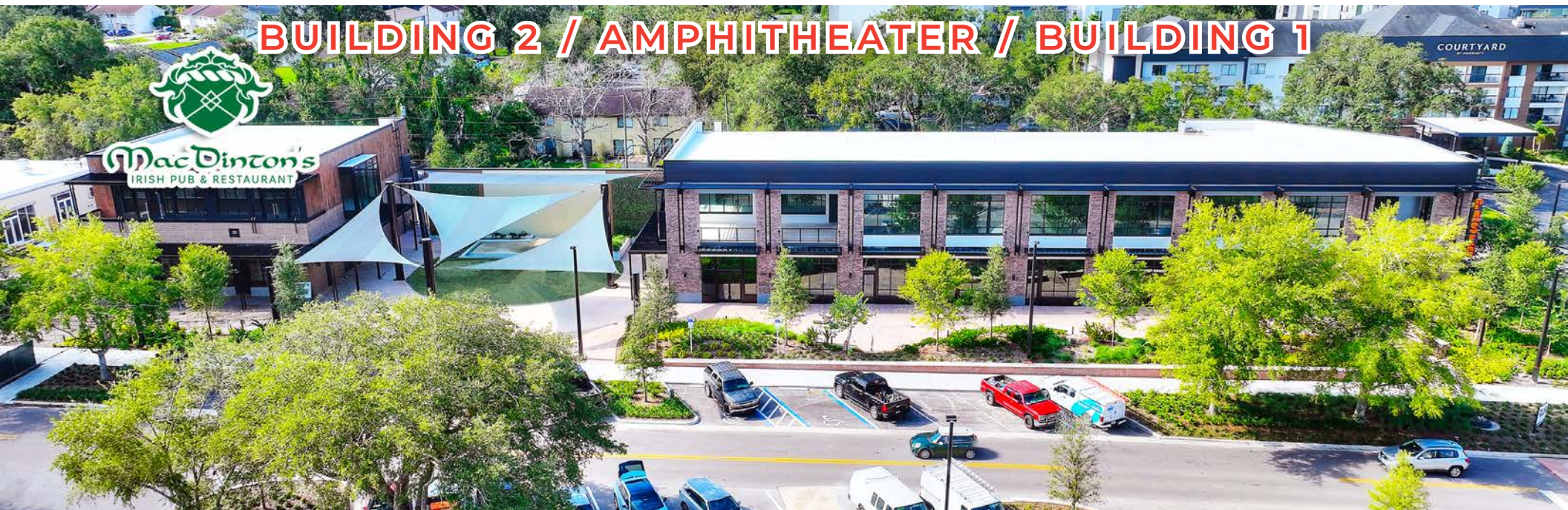
BUILDING 2 / AMPHITHEATER / BUILDING 1