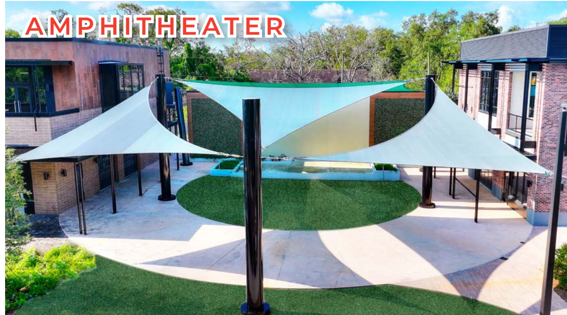
PHASE 1 CONSTRUCTION PHOTOS