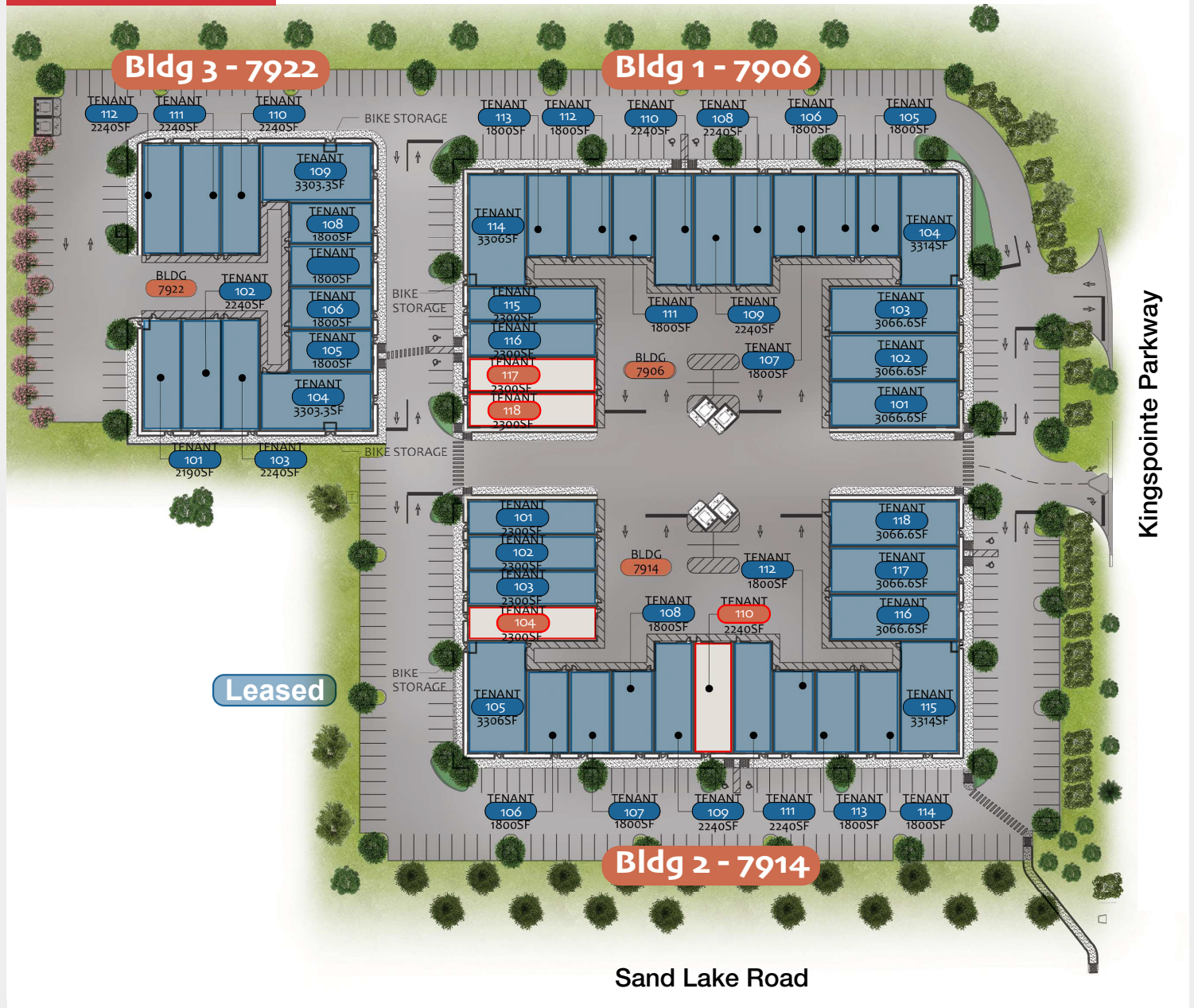
Building 2 - Frontage on Sand Lake Road