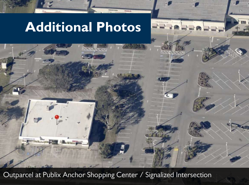
Outparcel at Publix Anchor Shopping Center / Signalized Intersection