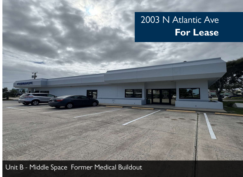
Unit B - Middle Space Former Medical Buildout