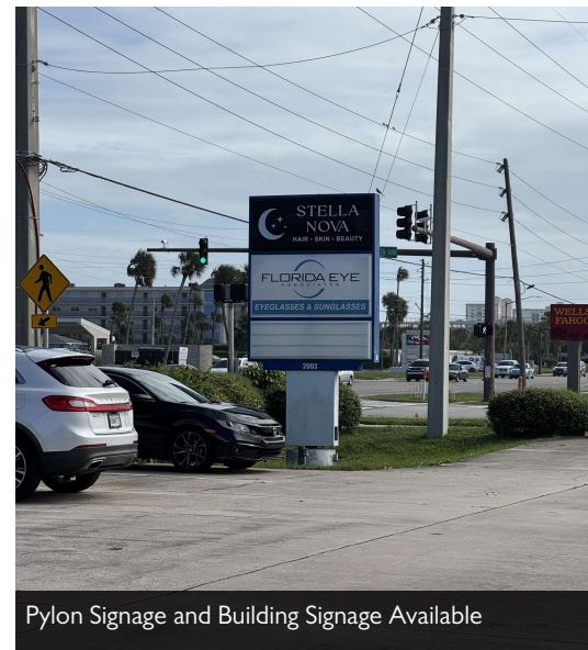
Pylon Signage and Building Signage Available