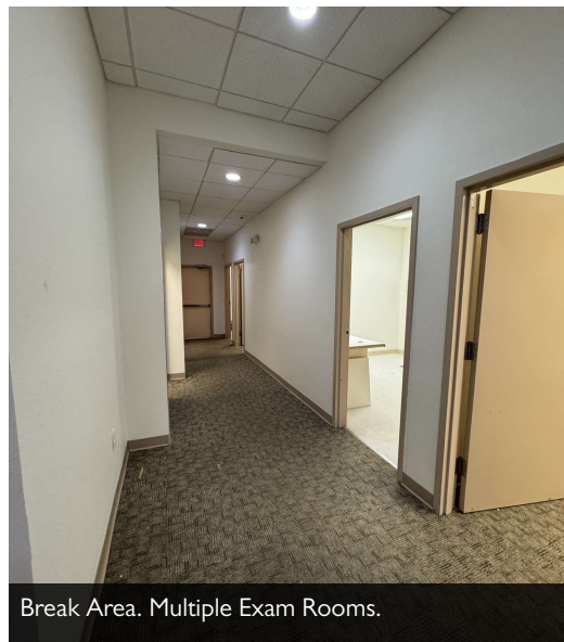
Break Area. Multiple Exam Rooms.