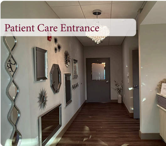
Patient Care Entrance