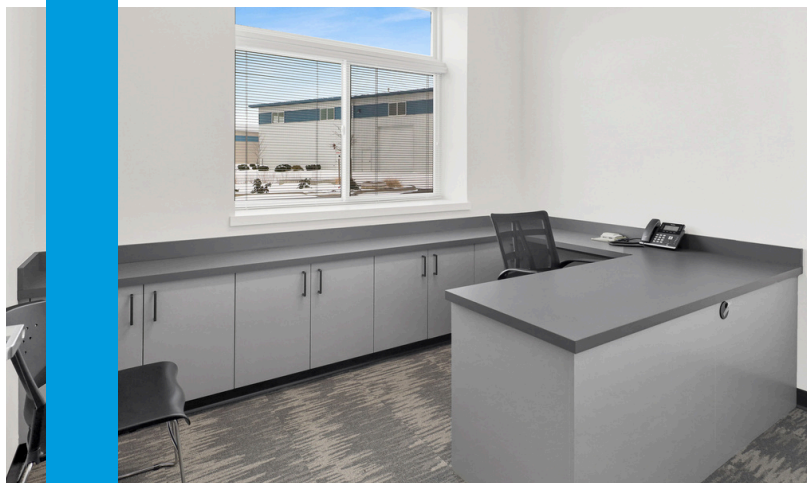
Main Floor Office