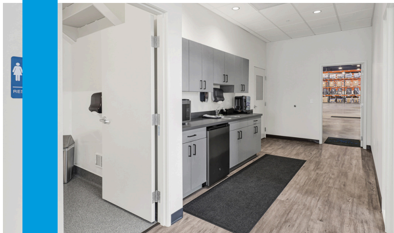
Main Floor Restroom & Coffee Bar