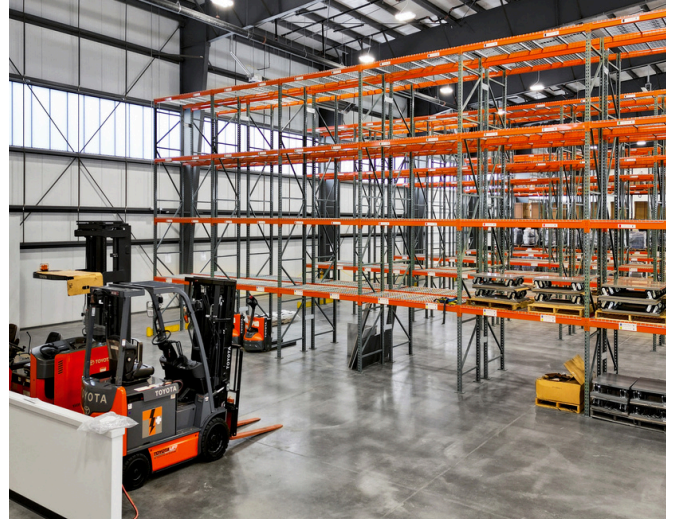
Parts Storage Racking System