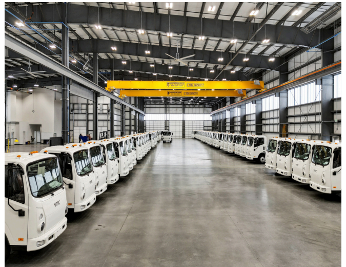
Main Manufacturing Floor w/ 3-Ton Overhead Cranes