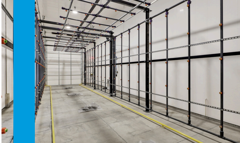
Water Leak Test Bay