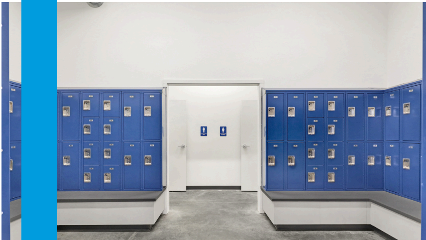
Employee Lockers & Restroom