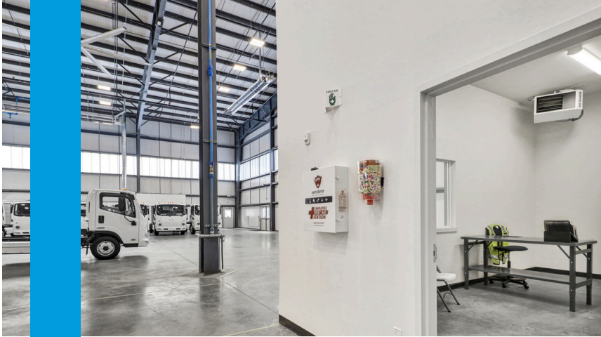
Manufacturing Floor Manager Office