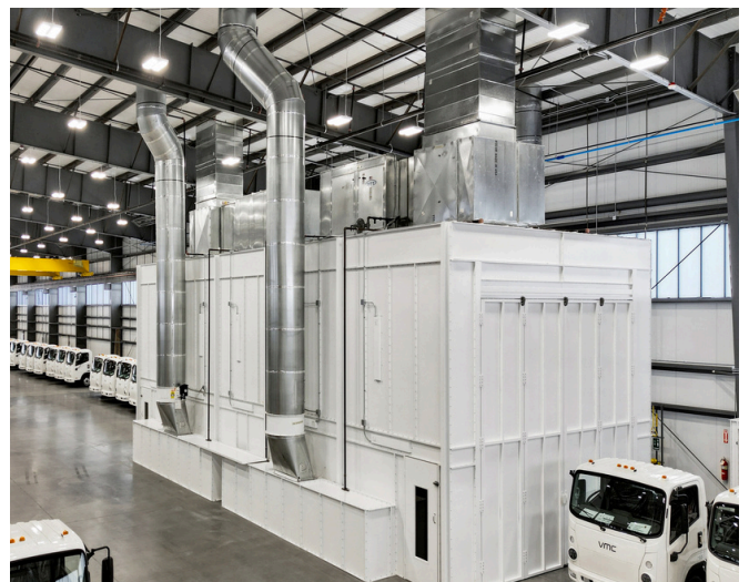
1,200 SF Paint Booth - Exterior