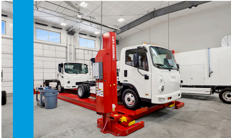
Shop Area W/2 (two) Truck Lifts