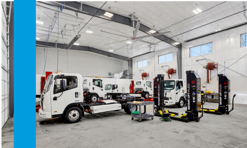
Shop Area W/Vehicle Lifts