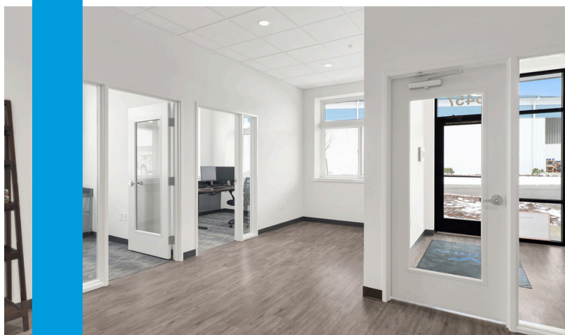
Main Floor Office Space