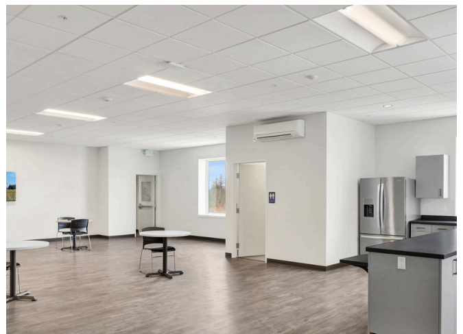
2nd Floor Lunch Room