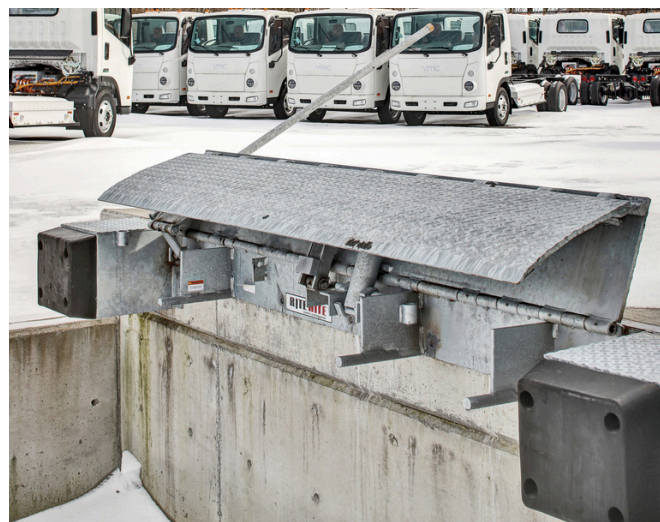
Dock High Vehicle Loading

Strategically located near I-5 and the Canadian border, this cutting-edge manufacturing facility was originally built for EV Bus manufacturing but has never been occupied. The property is currently in receivership as part of company divestiture. This rare opportunity offers unmatched features with no comparable properties currently available.