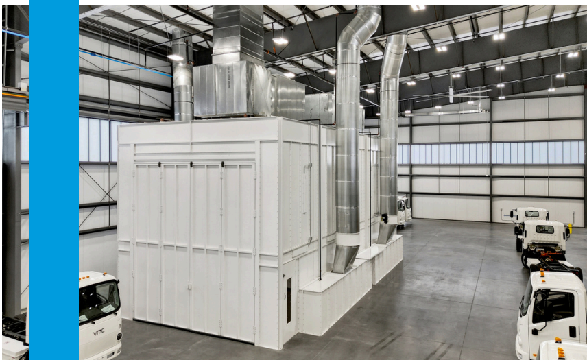
1,200 SF Paint Booth